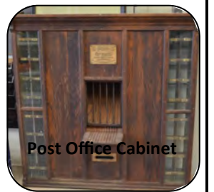
Post Office Cabinet